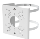
SN-CBK627D Pole Mount